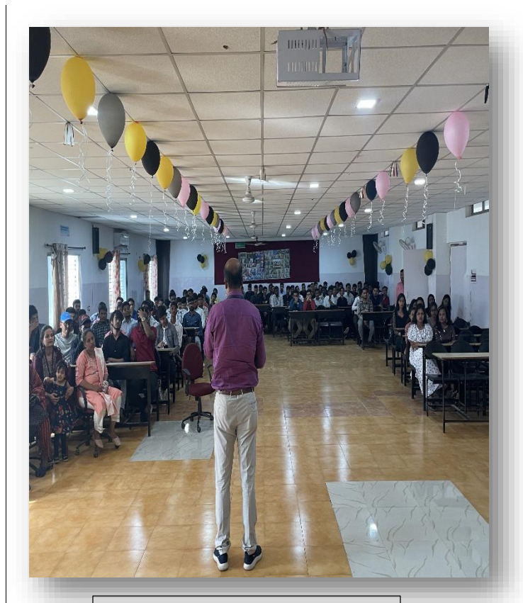
HOD sir addresses to Fresher's