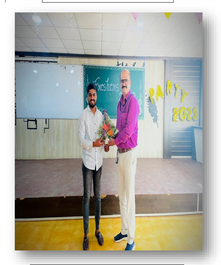
Felicitation of General Secretary (GS)